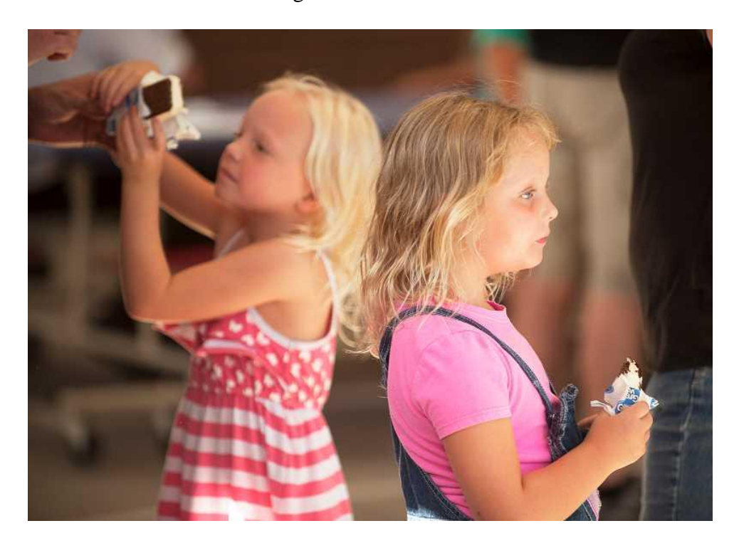
houghts of school resuming took a back seat to the array of frozen treats available at Boeckman Creek Primary School last Thursday.

With the start of school just days away, Wilsonville's primary schools took an early opportunity to welcome students back Aug. 28.